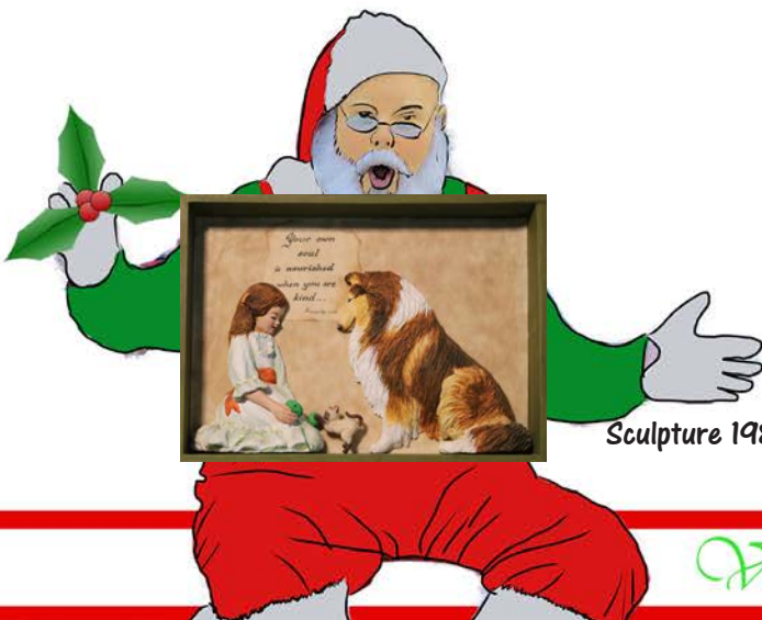
Sculpture 1982 M. Kummer